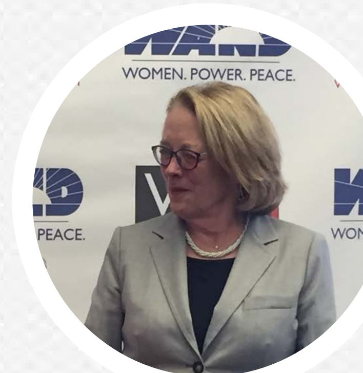
Niki Tsongas Massachusetts District 3