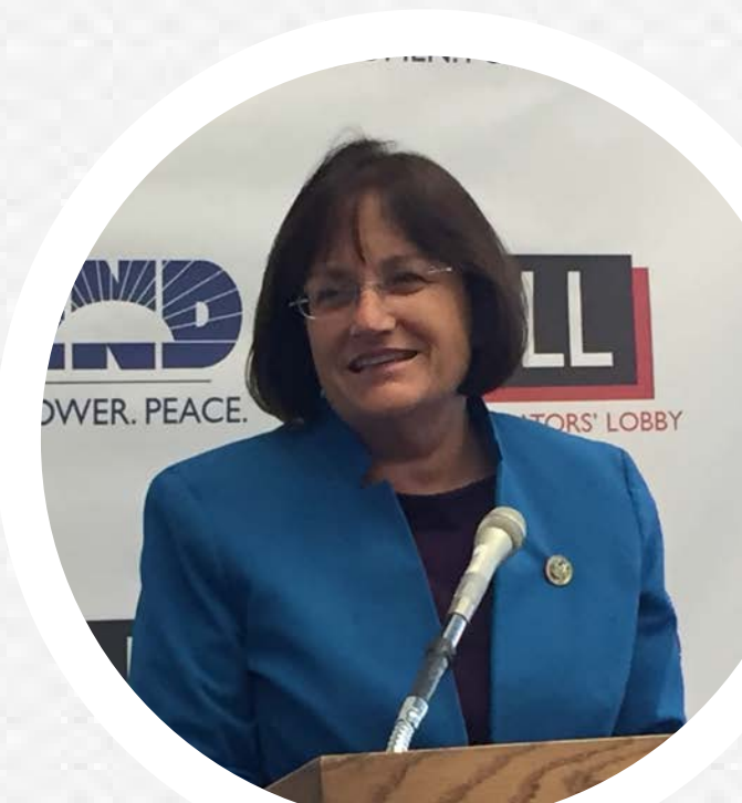
Ann Kuster New Hampshire District 2