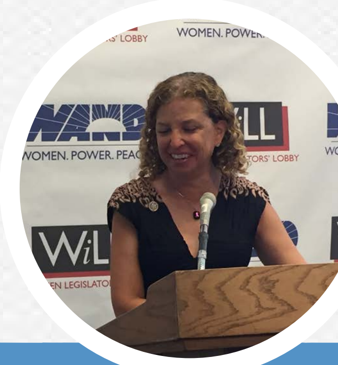
Debbie Wasserman-Schultz Florida District 23