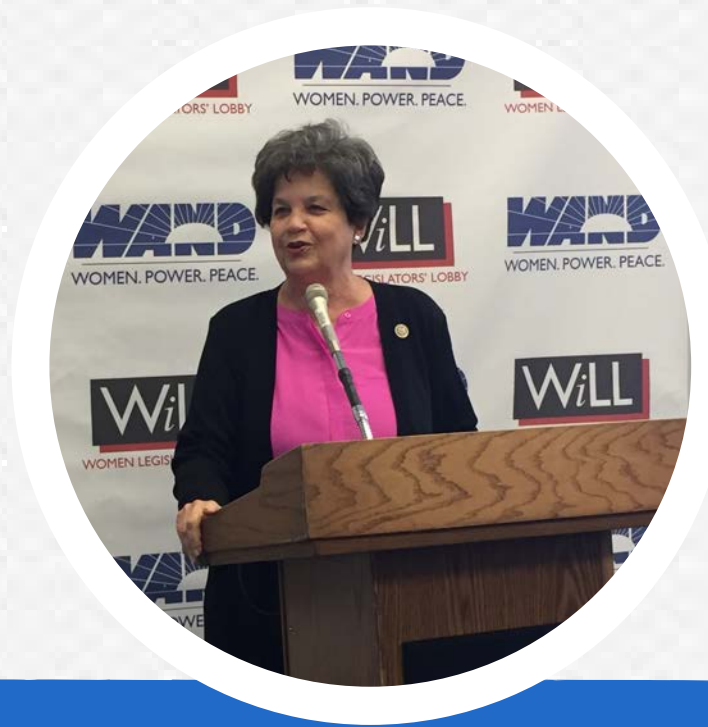
Lois Frankel Florida District 24