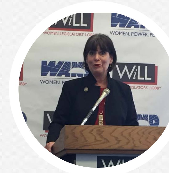
Betty McCollum Minnesota District 4